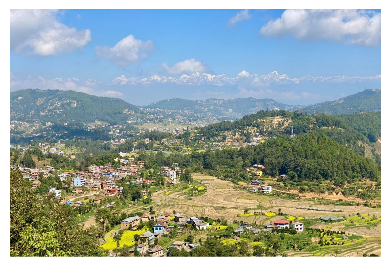
Figure 12: Balthali, a village of the Newar community, situated in the Kathmandu Valley basin at an altitude of 1,700 meters

The second tour led to the Namobuddha Monastery, an important Buddhist pilgrimage site. According to legend, Buddha once sacrificed his life at this location to save a starving tiger. The monastery complex exudes a profound sense of spirituality and tranquility, while the surrounding area impresses with its verdant hills and spectacular views.