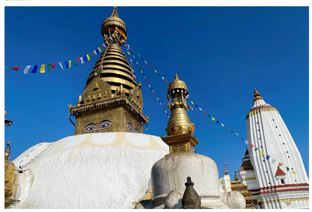
Figure 11: Swayambhunath Temple Complex

Perched atop a hill overlooking Kathmandu Valley, the Swayambhunath Temple Complex – popularly known as the Monkey Temple – offers breathtaking panoramic views. This sacred Buddhist site, adorned with a striking white stupa and gilded spire, is one of Nepal's oldest and most iconic religious landmarks. The presence of playful monkeys adds a unique charm to the spiritual atmosphere, making it a must-visit destination.